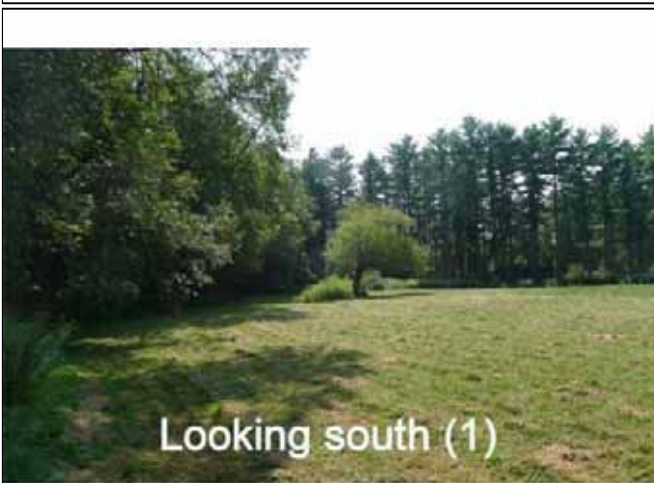
Looking south (1)