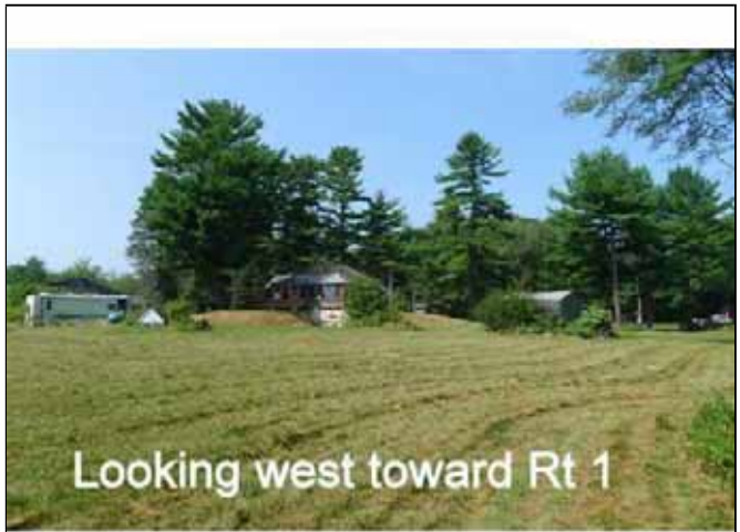
Looking west toward Rt 1