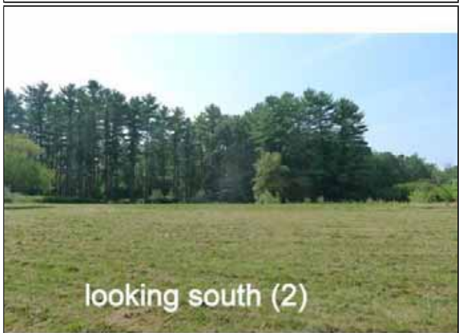
looking south (2)