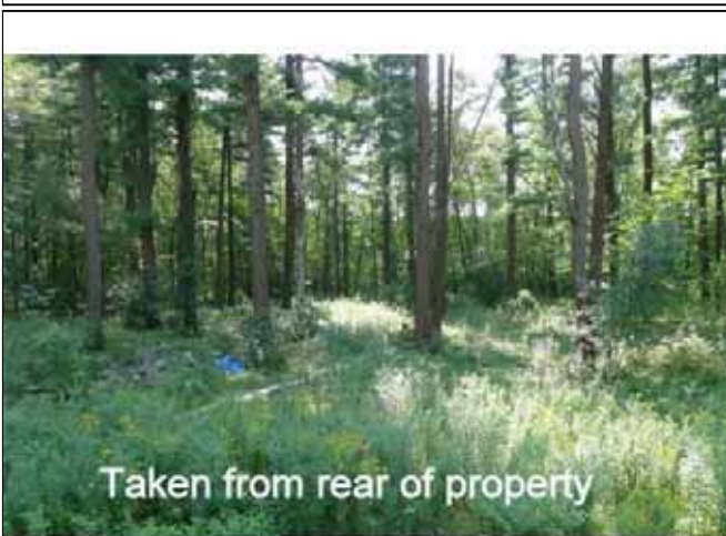
Taken from rear of property