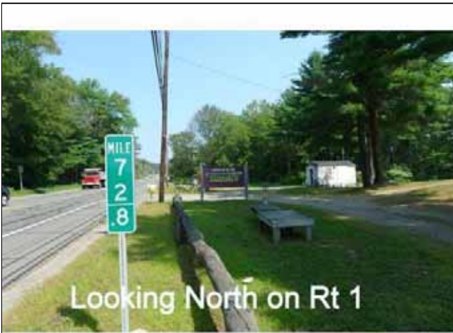
Looking North on Rt 1