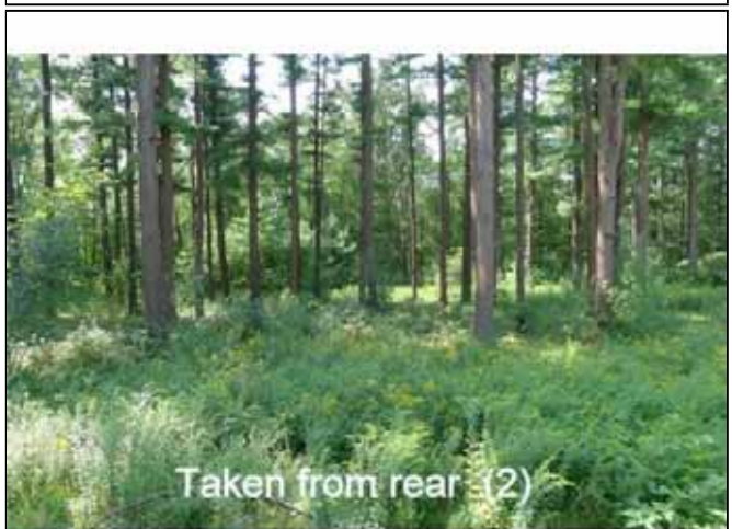
Taken from rear (2)